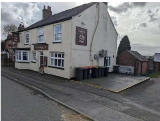
The Durham Ox

We learned that the Durham Ox had the reputation of being haunted – it was said that a glass of beer levitated on its own, and the beer cellar was best avoided, due to its unpleasant previous usage to store corpses. In the past, pubs were often used for a variety of different purposes, including inquests and auctions.