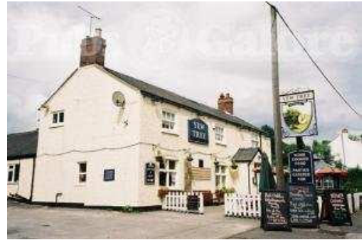
The Yew Tree

Next month, we will discuss Local Business, including factories and potteries.